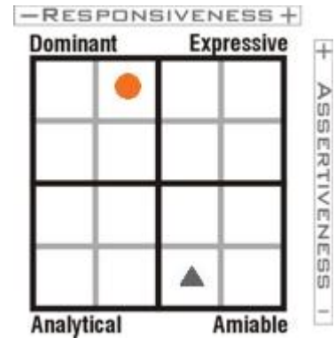
● About: Kane Pitman Dominant/Expressive ▲ Requested By: Travis Alderman Amiable/Analytical

Remember to stay on track; don't be distracted by details. Be more assertive with task-focused people. Maintain your relationships but don't forget that work is the first priority. Make direct eye-contact and speak up to raise assertiveness.